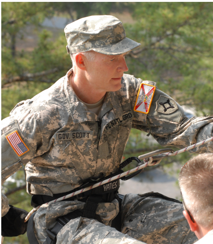
Gov. Rick Scott prepares to rappel down an air assault tower at Camp Blanding Joint Training Center, May 12. The governor visited several Florida National Guard facilities to meet with Guardsmen and learn more about the mission of the Florida National Guard.

Editor's Note: All times local. Florida's Veterans Service Organizations and veteran-related agencies provided the information in the table above. To submit event information, contact the editor at MurrayR@fdva.state.fl.us